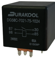
PCB version pictured